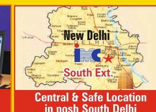
Central & Safe Location in posh South Delhi