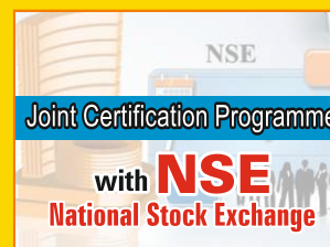
Joint Certification Programme with NSE National Stock Exchange