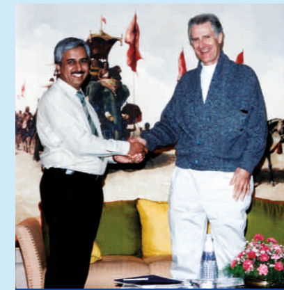
Technical Tie-up with Clayton Univ., USA