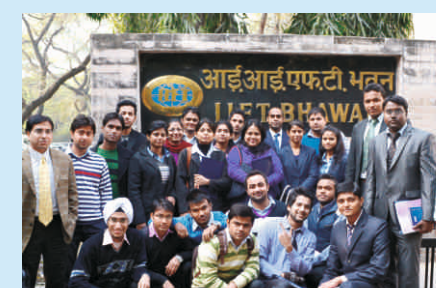
Training at IIFT, New Delhi