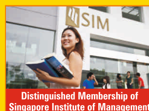
Distinguished Membership of Singapore Institute of Management