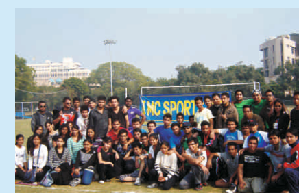
IMC Sports Meet at IIT, Delhi