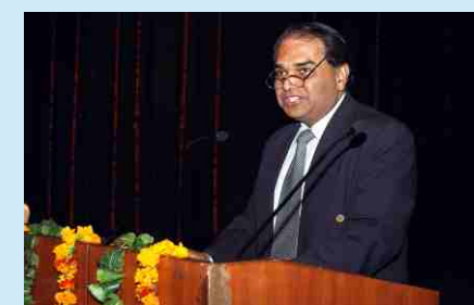
CEO Maruti at IMC