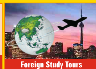
Foreign Study Tours